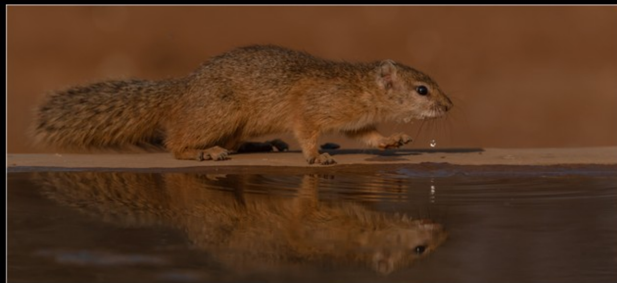
NA-M-A De Klerk-37-G-Klaar Gedrink