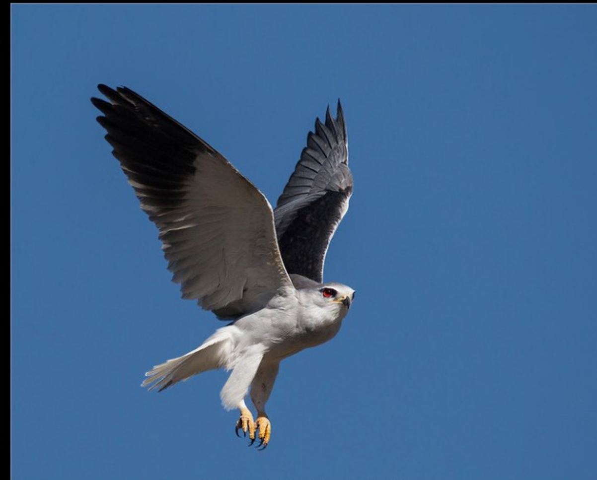
NB-M-Annette Ligthelm-38-G-Black Shouldered Kite