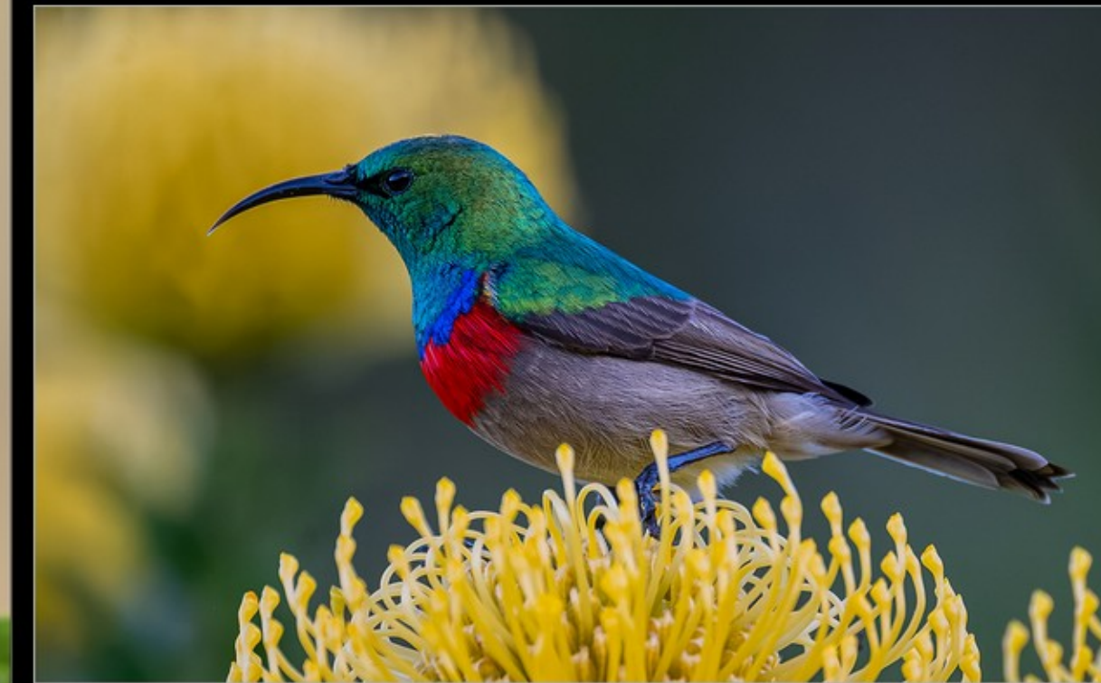
NB-M-Ona Ackermann-40-COM-Sonsoeker Suikerbek