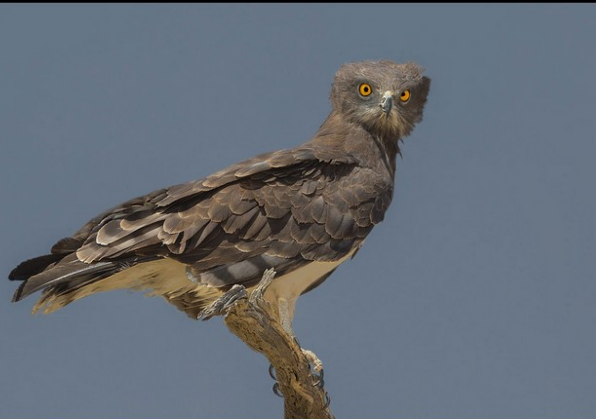
NB-M-Andre Ligthelm-37-G-Black Breasted Snake Eagle