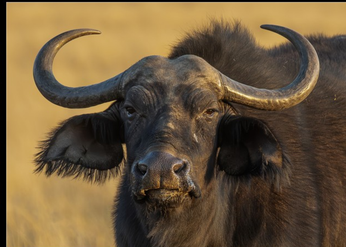
NA-M-Hennie Du Plessis-36-G-Not Impressed