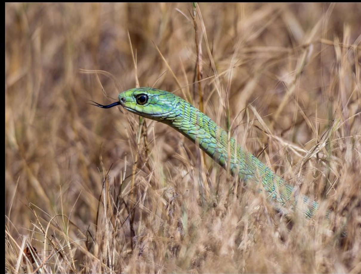
NA-M-Arthur Edward Ahrens-33-G-Something In The Grass