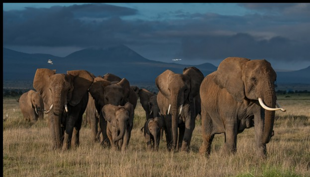
NA-M-Tania Cholwiche-35-G-A Herd Of Golden Elephants