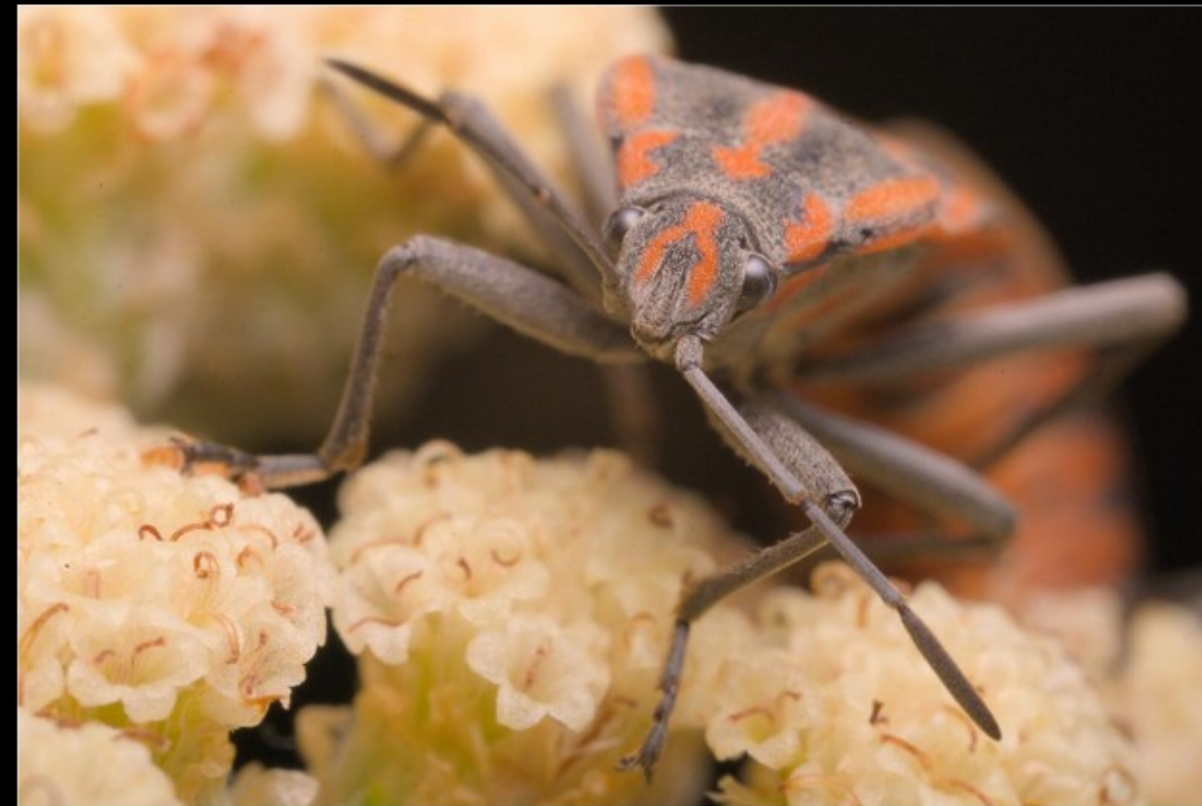
NA-5 star-Willem Semmelink-33-G-Insek Op Wit Blom