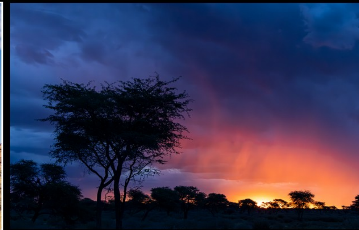
SC-4 star-Keith Boehme-36-G-Storm Sunset