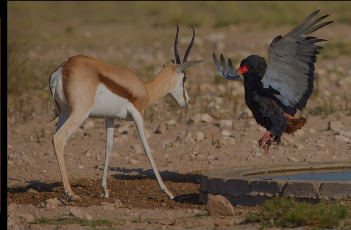
NB-M-Hennie Niemand-37-G-Back Off 1023