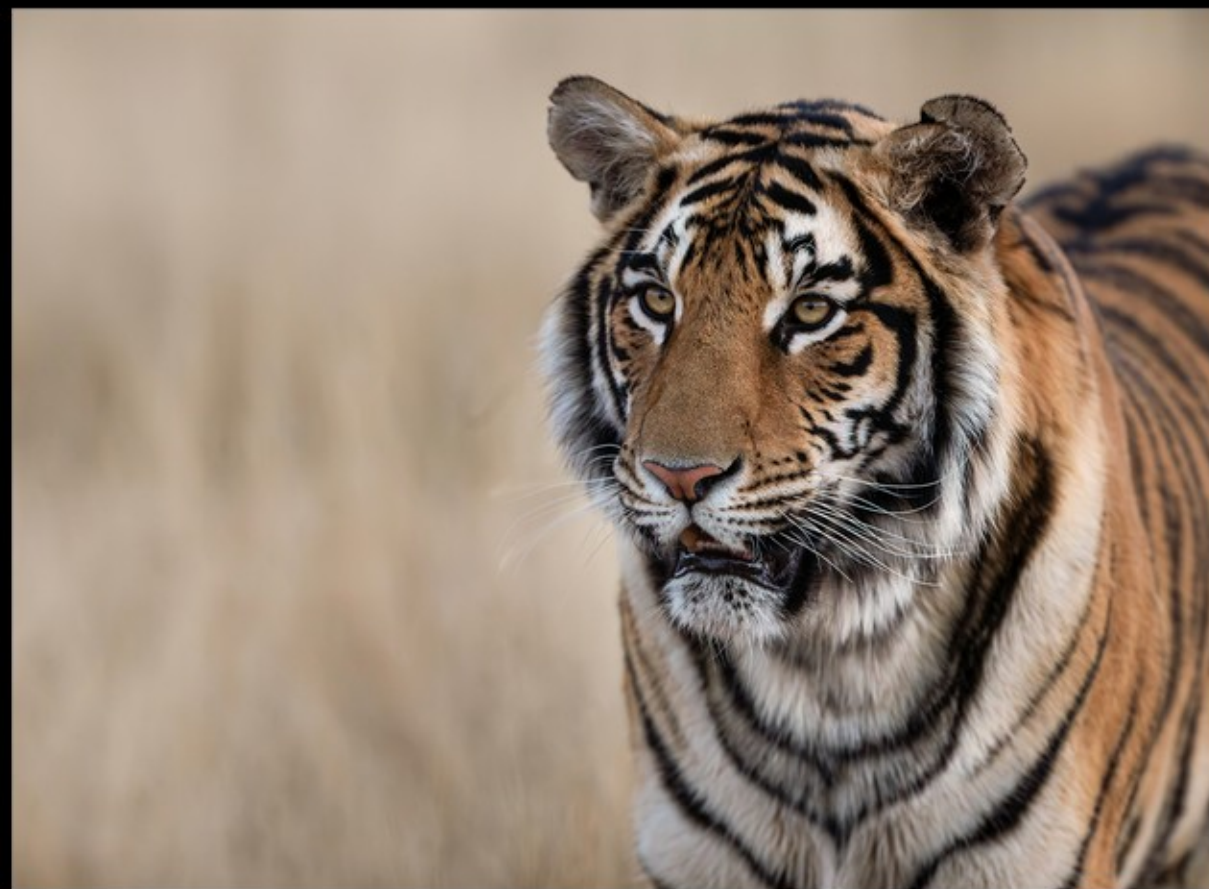
NA-5 star-Rina Hattingh-36-G-Bengal Tiger