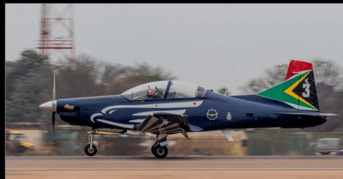
PJ-M-Hannes Van Den Berg-35-G-Silver Falcon Touchdown