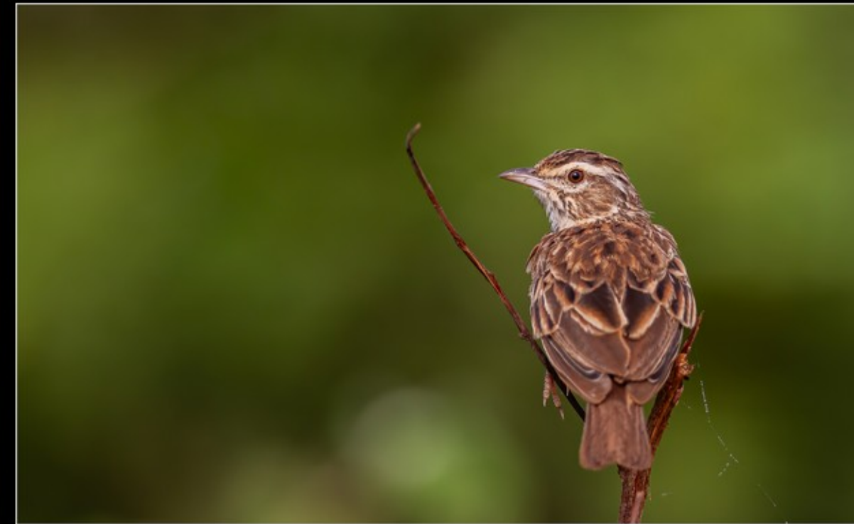
NB-2 star-Peet Van Eeden-36-G-Sabotalewerik