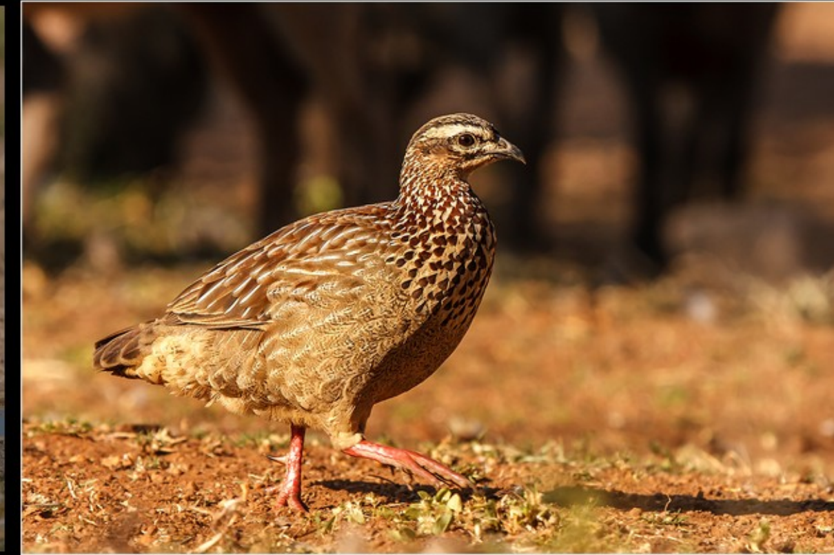
NB-M-Henning De Beer-36-G-Patrys