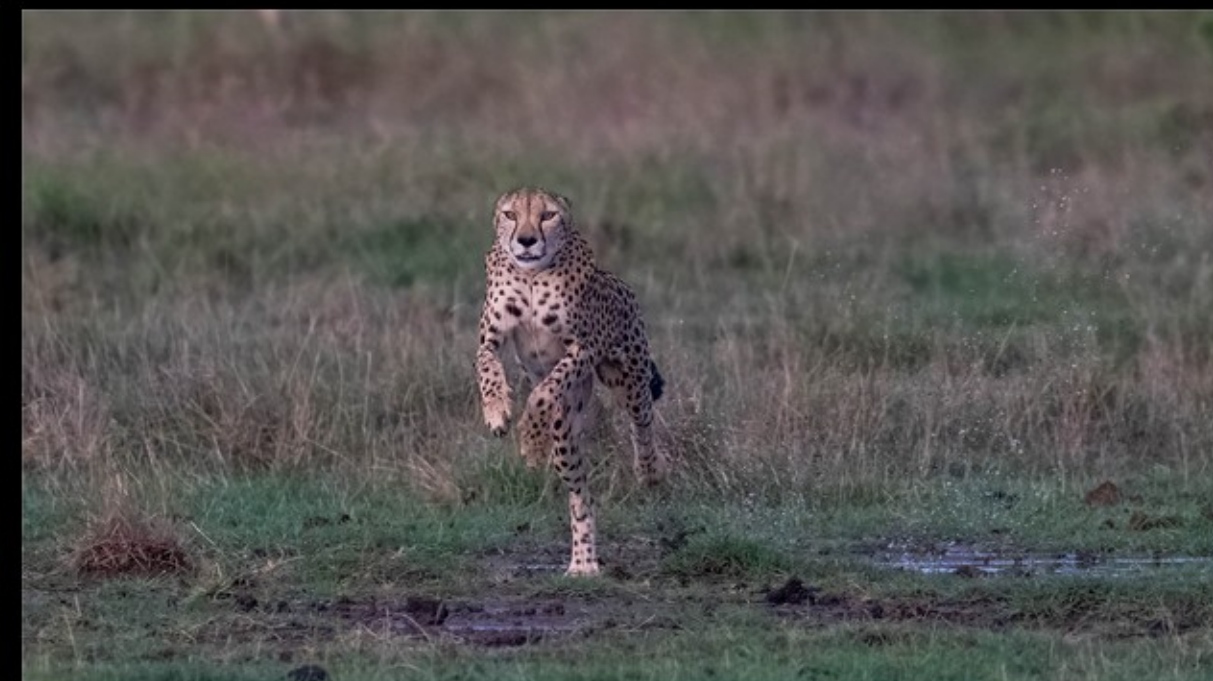
NAM-Johan Greyling-36-G-Cheetah At Full Speed