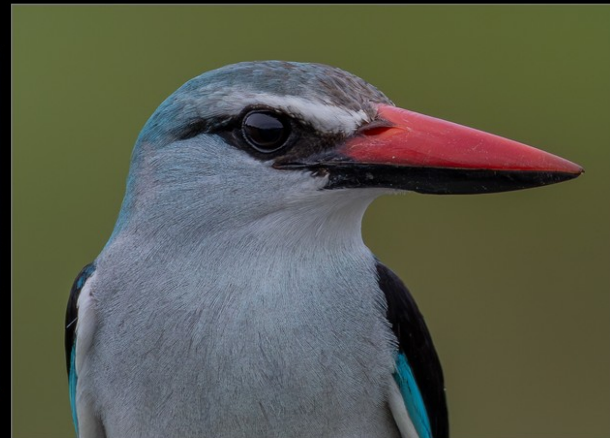
NB-M-Hannes Van Den Berg-37-G-Woodland Kingfisher