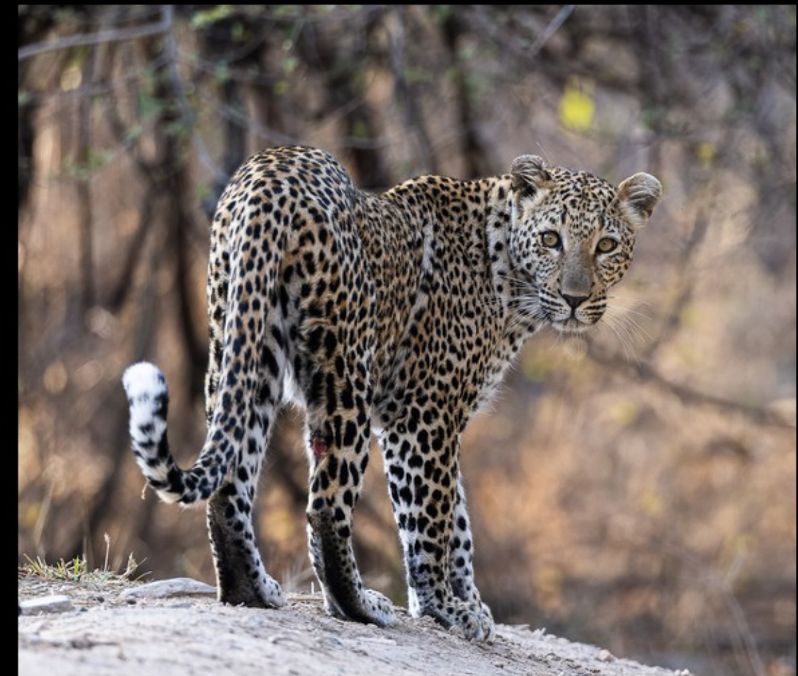
NA-4 star-Keith Boehme-34-G-Looking Back