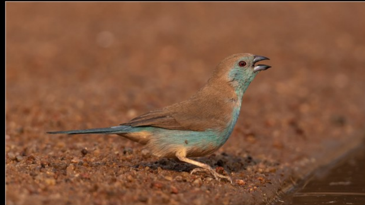
NB-M-Aj De Klerk-38-G-Blousysie By Watengat