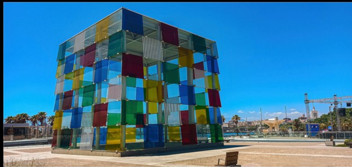
PO-M-Trippie Vsser-33-G-Glaskas In Malaga