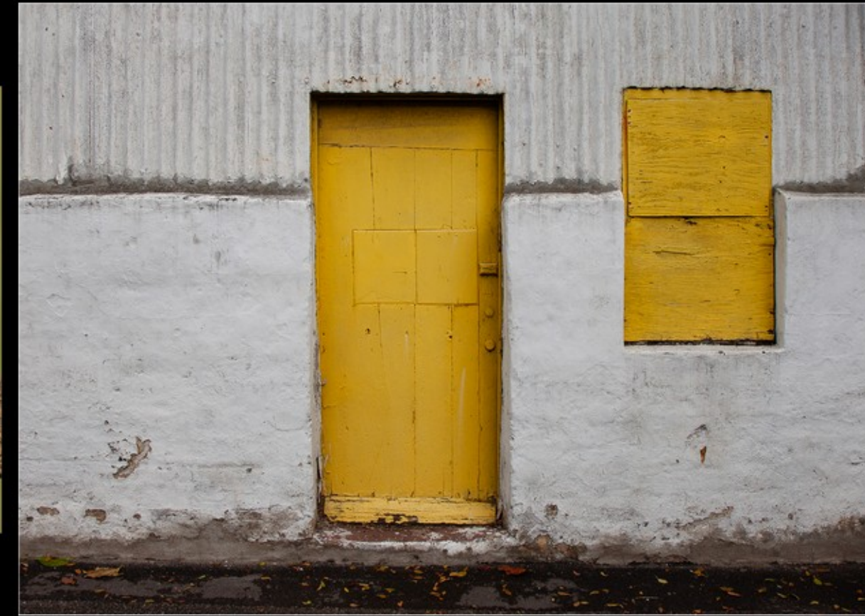
PO-M-Hennie Du Plessis-35-G-Yellow