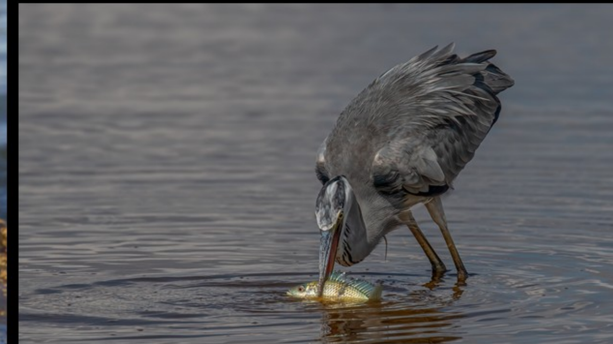
NB-M-Tania Cholwiche-38-G-Golden Catch