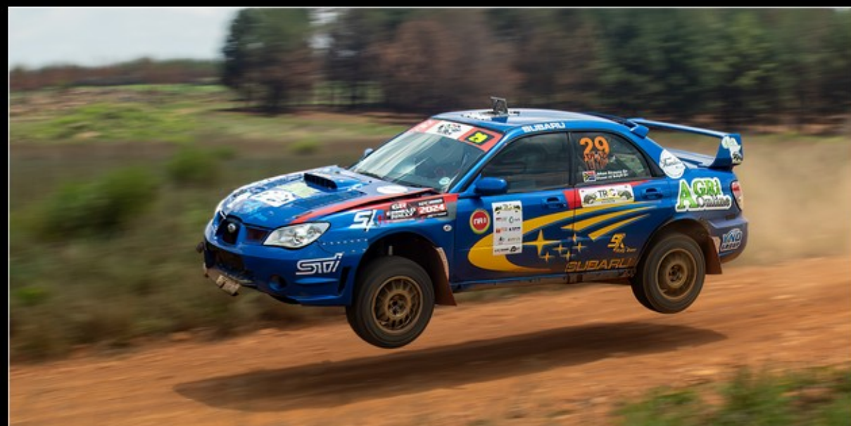
SP-M-Dries Beetge-38-G-Strauus Fly 32 Meters