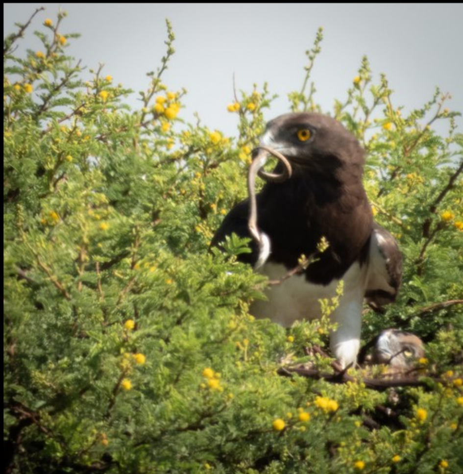
NB-3 star-Lydia Wolmarans-27-G-Kleine Swartborslangarend Word Gevoer