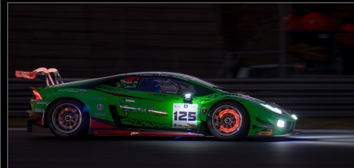
SP-M-Dries Beetge-37-G-Hard Brake Night Race