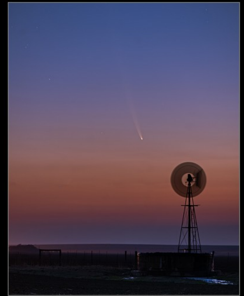
PJ-M-Ona Ackermann-35-G-Komeet Oor Die Mystaat