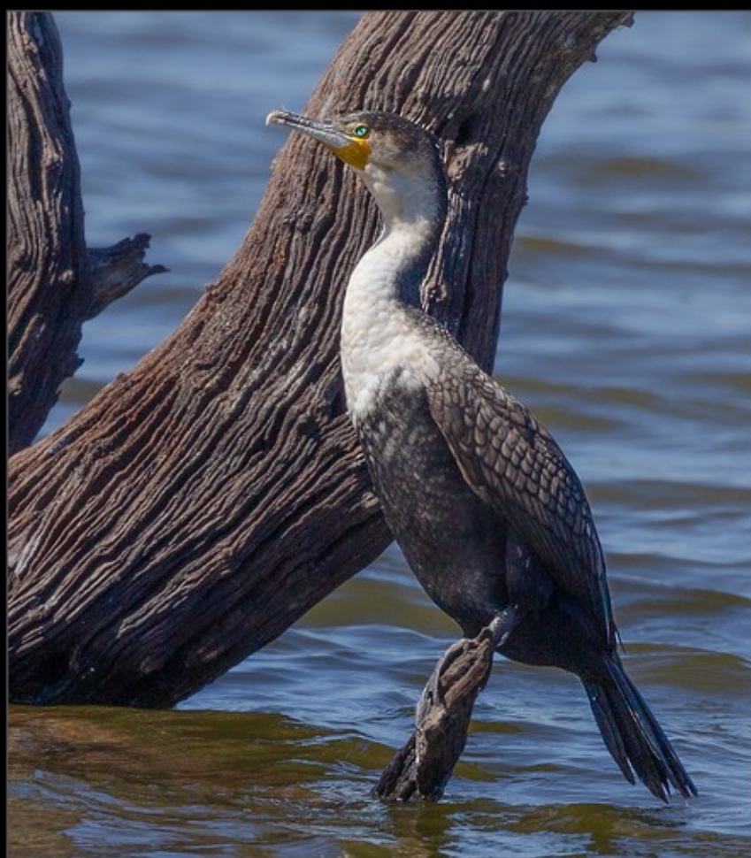
NB-4 star-Sandra Van Dyk-35-G-By Stille Waters