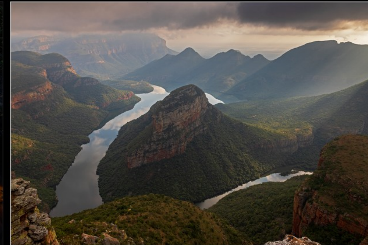
SC-M-Chrissie De Beer-38-G-Blyde Rivier