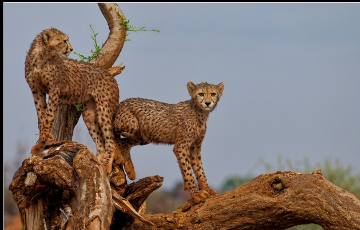
NA-M-Ezabe Bogenhofer-36-G-Klim Boom Om Beter Te Kan Sien