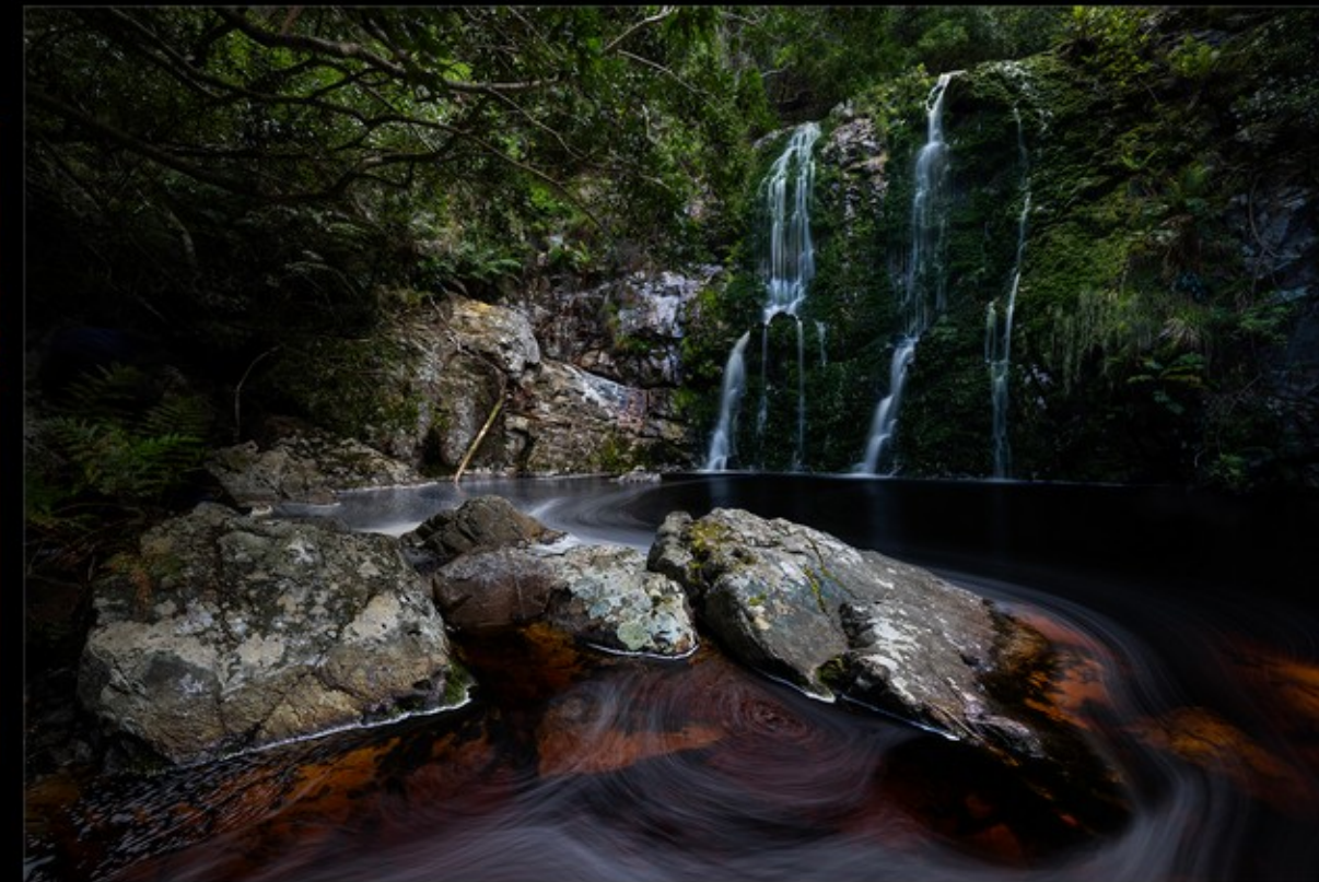
SC-5 star-Rina Hattingh-39-COM; Ctg WIn-Mountain Stream