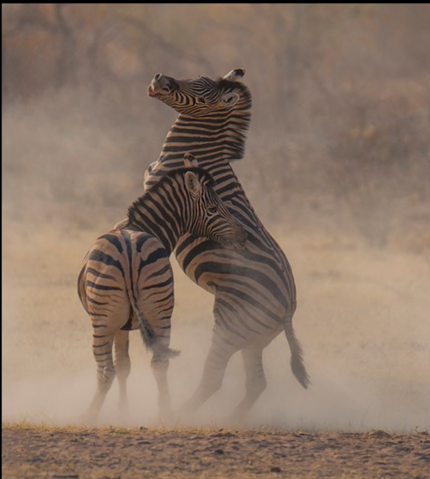
NAM-Hennie Niemand-37-G-Hingsgeveg 0824