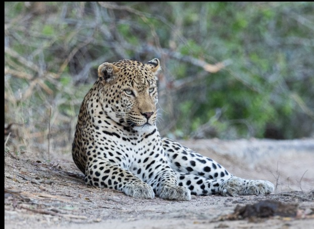
NA-4 star-Keith Boehme-32-G-Resting