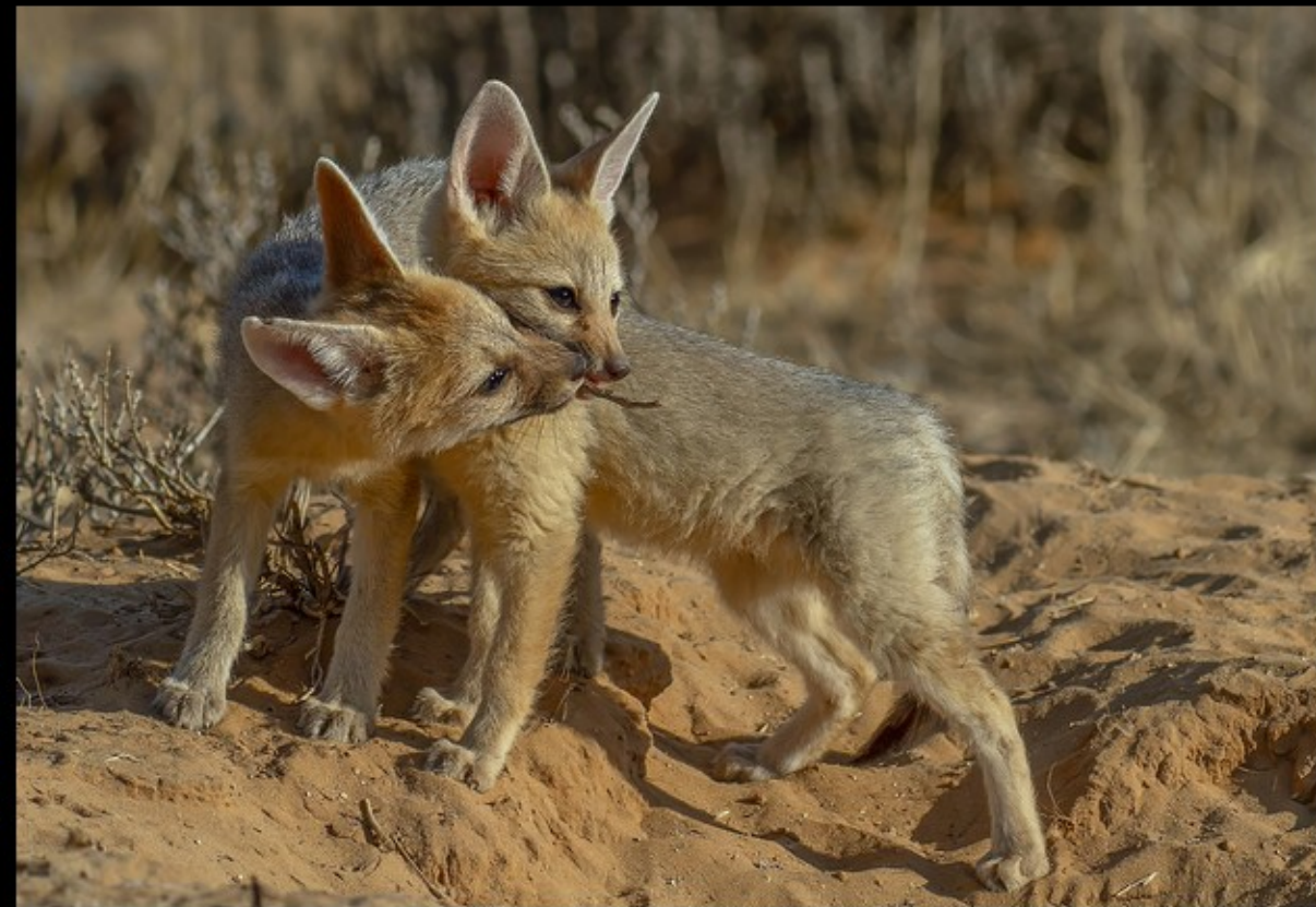
NAM-Sonelle Basson-38-G-Sharing A Toy