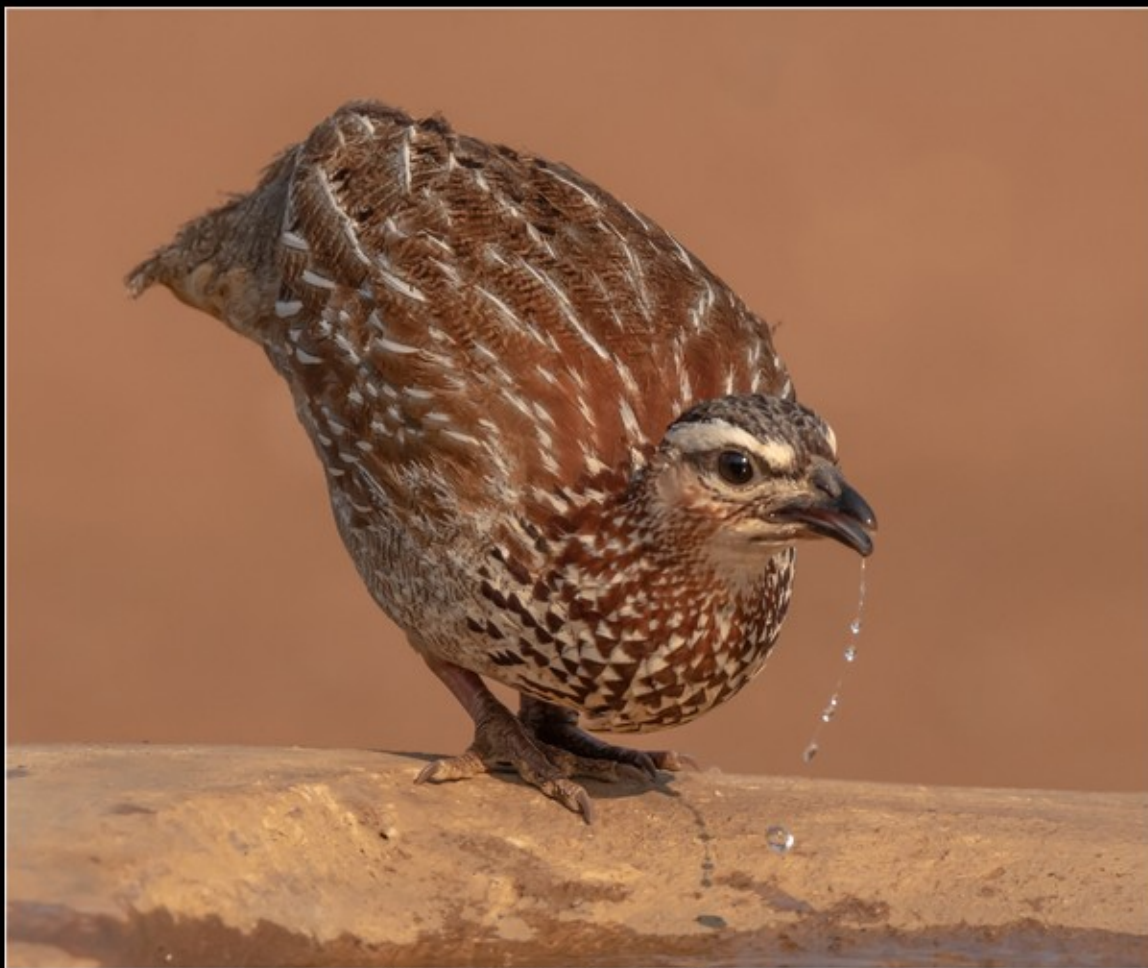
NB-M-Aj De Klerk-37-G-Bospatrys Drink Water