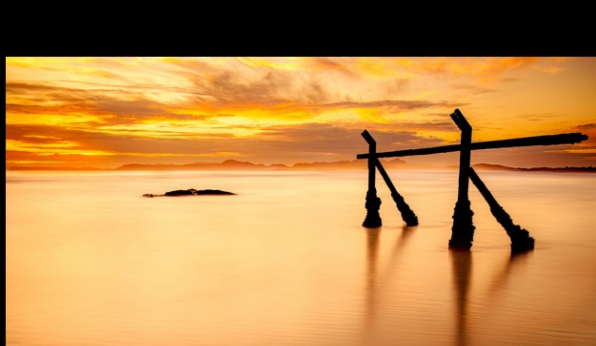
SC-5 star-Carima Van Den Berg-39-COM-Autumn Sunset