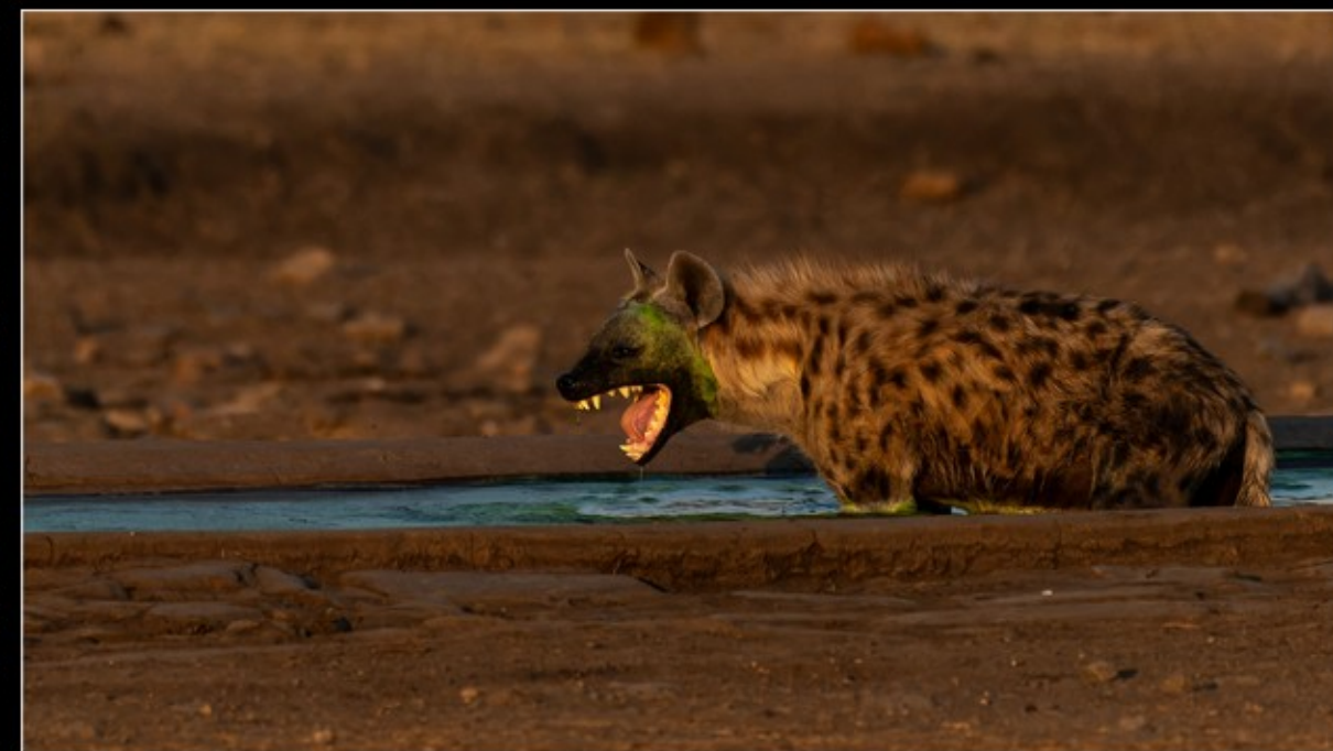
NA-5 star-Maritha Koch-35-G-The Mask