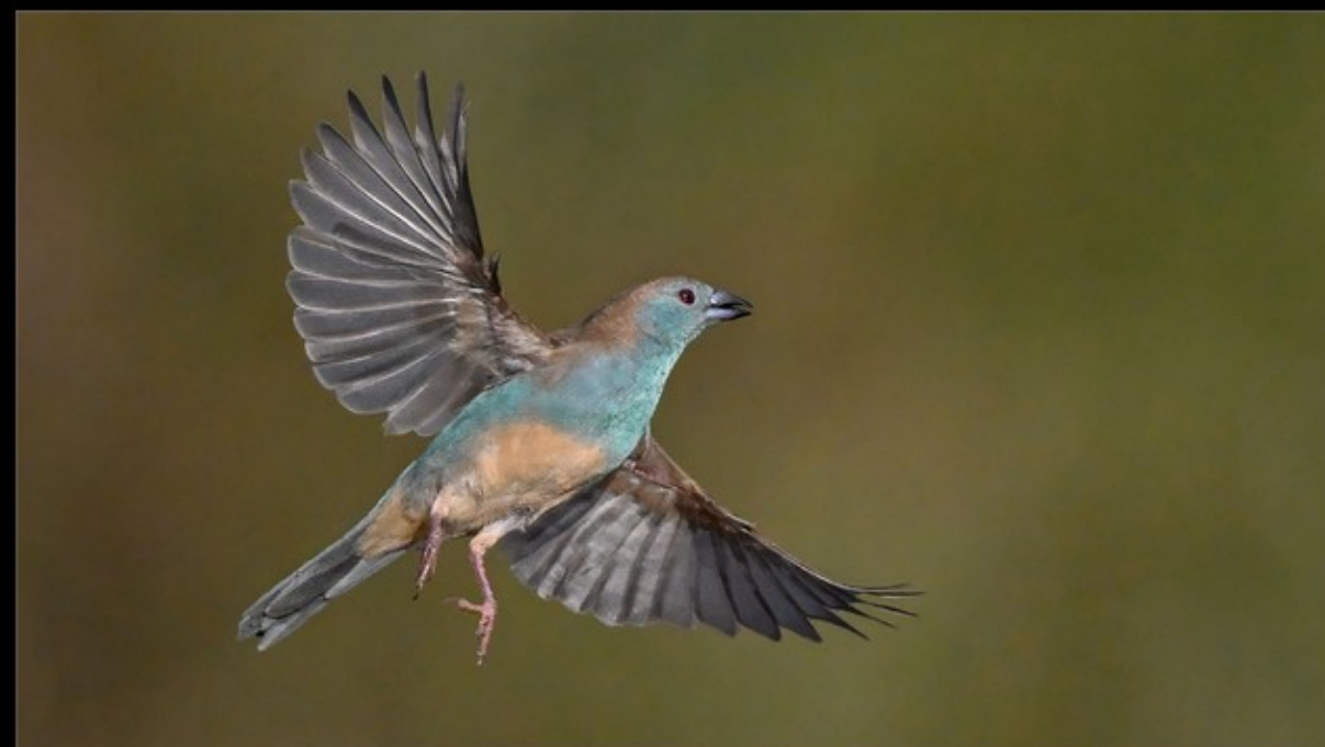
NB-5 star-Hans Bogenhofer-33-G-Blog Syste