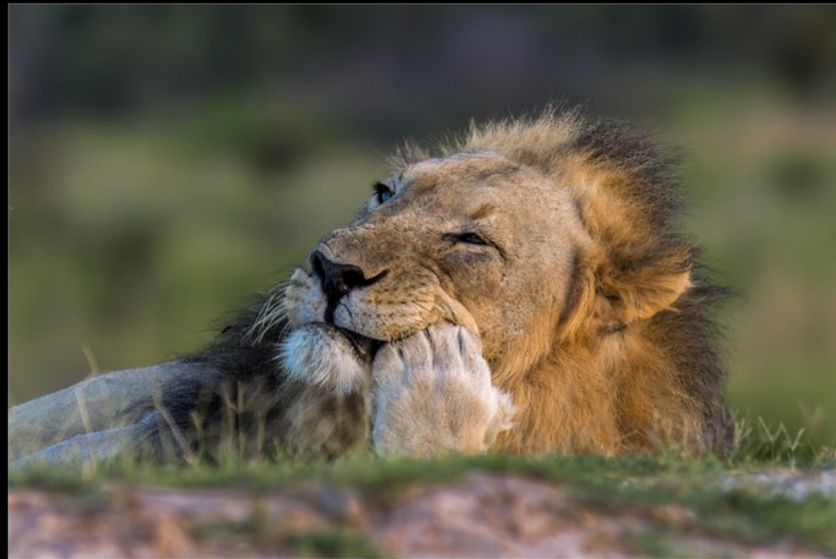
NA-3 star-Pieter Jordaan-37-G; WIN; Ctg WIn-Leeus 'Mos' Ook Tande