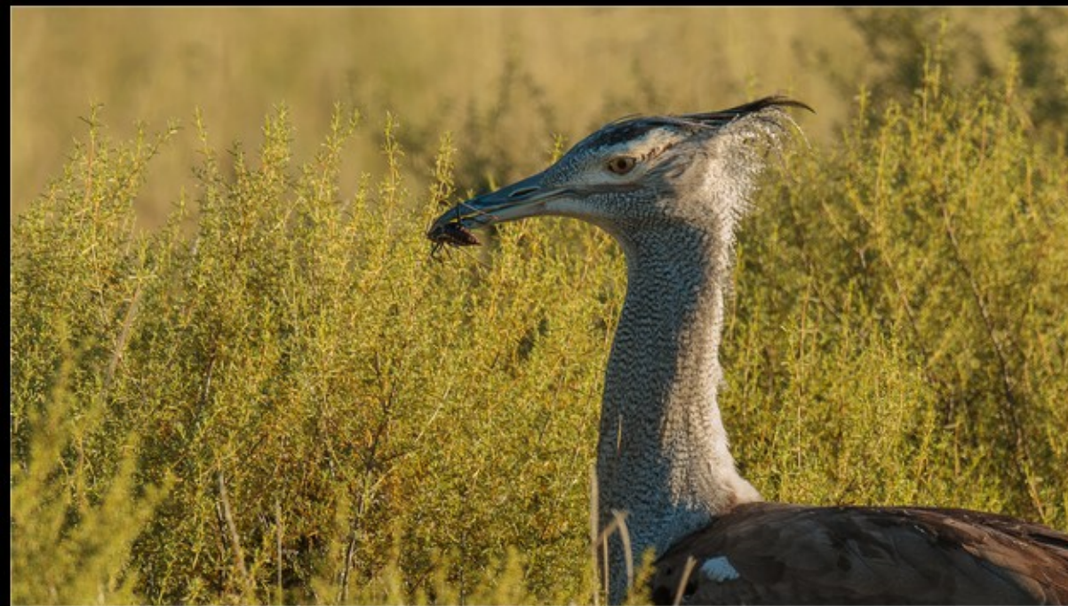
NB-M-Riaan Van Den Berg-35-G-Kori Bustard With Snack