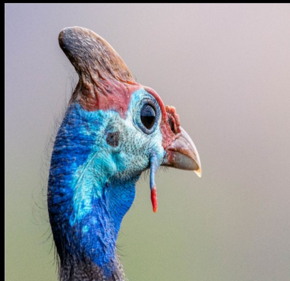
PO-4 star-Mechiel Brandt-32-G-Tarentaal Portret