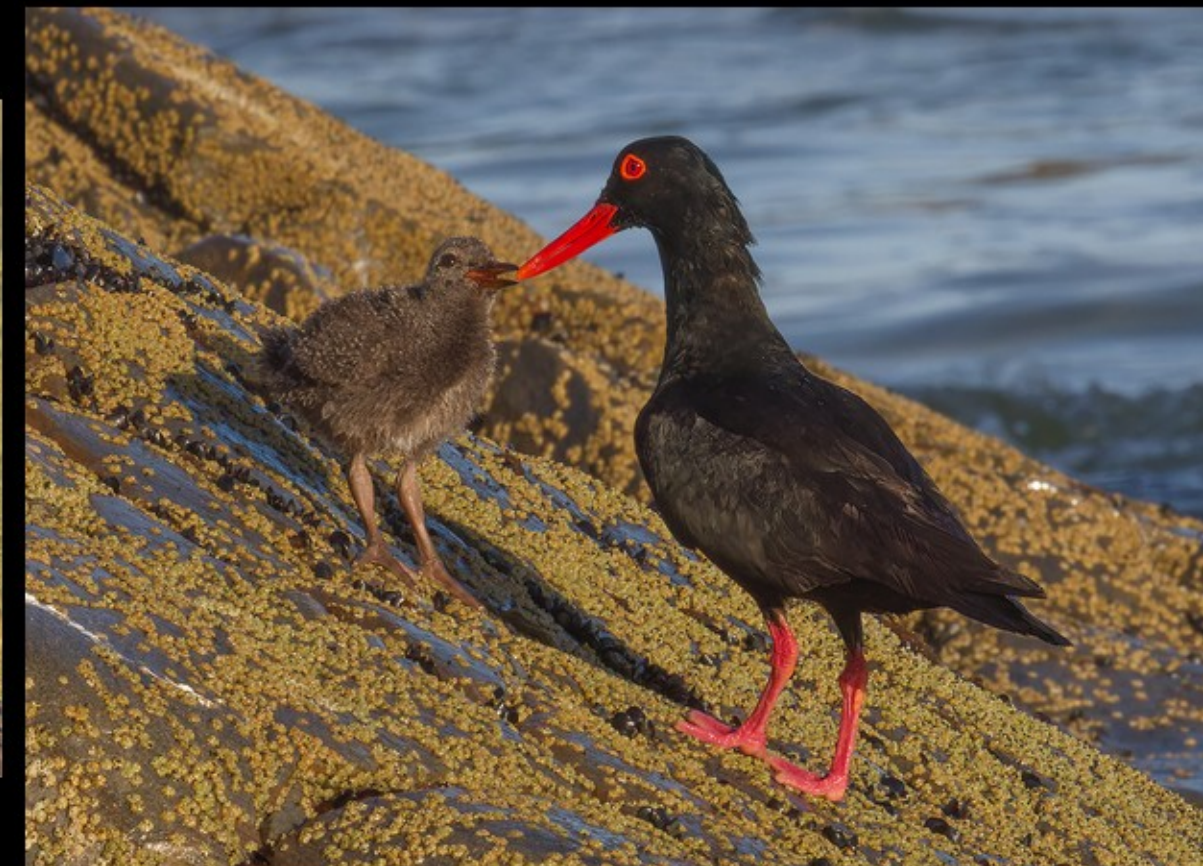
NB-M-Sonelle Basson-35-G-I Am Hungry