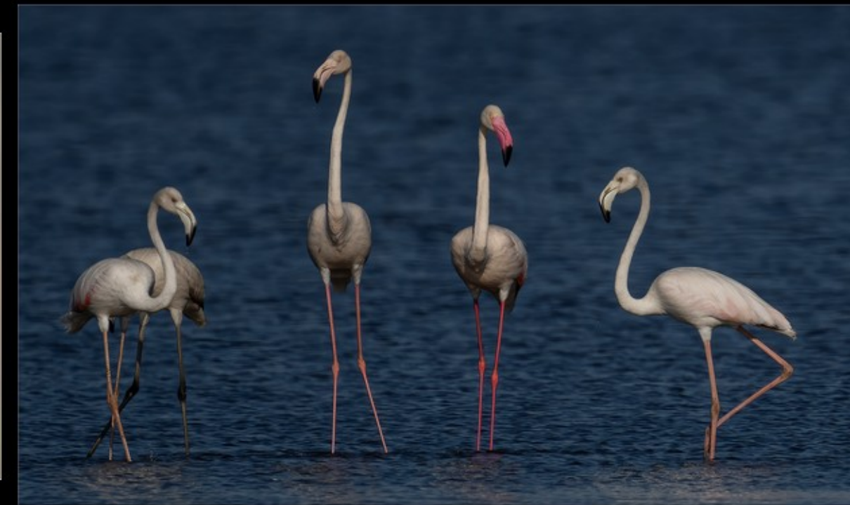
NB-M-Johan Greyling-36-G-Flamingo Family