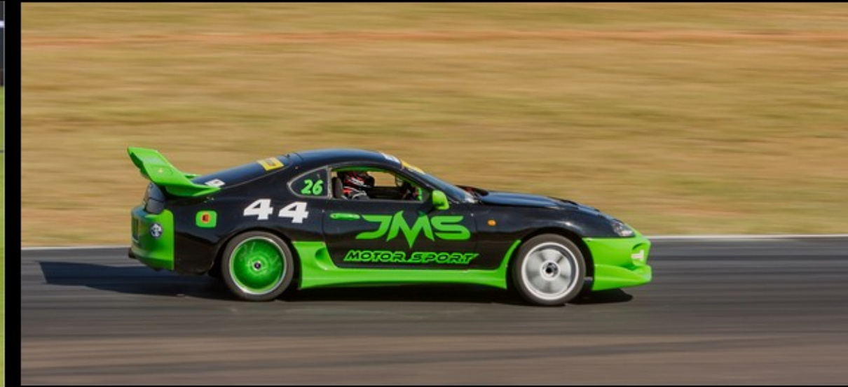
SP-M-Carien Kruger-35-G-Jms On The Track Speeding