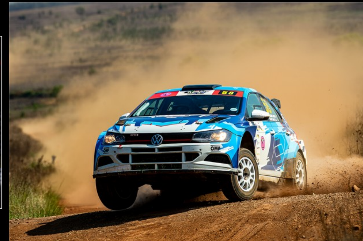
SP-M-Dries Beetge-37-G-Lauch The Oti