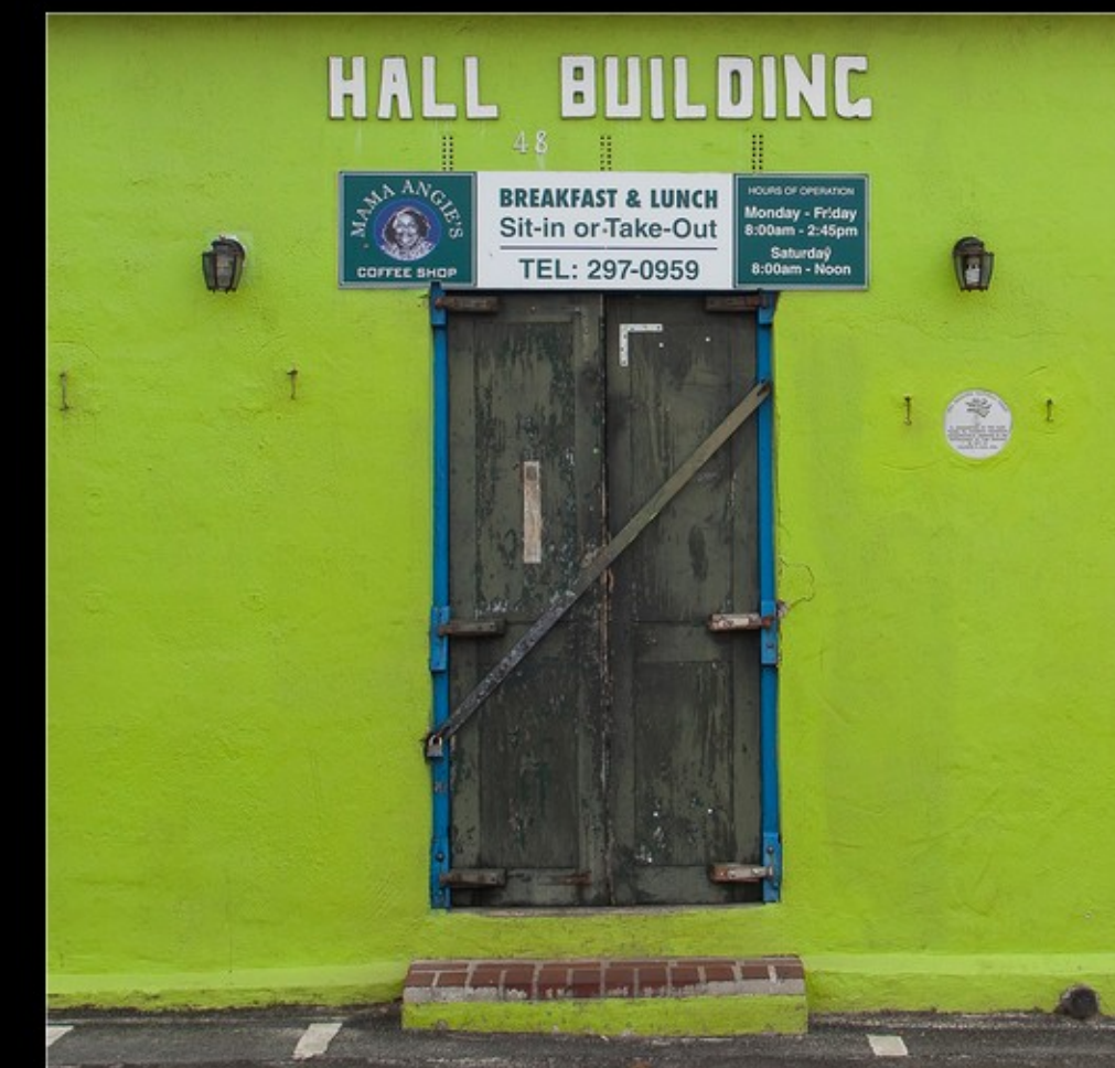
PJ-M-Hennie Du Plessis-33-G-Closed For Covid