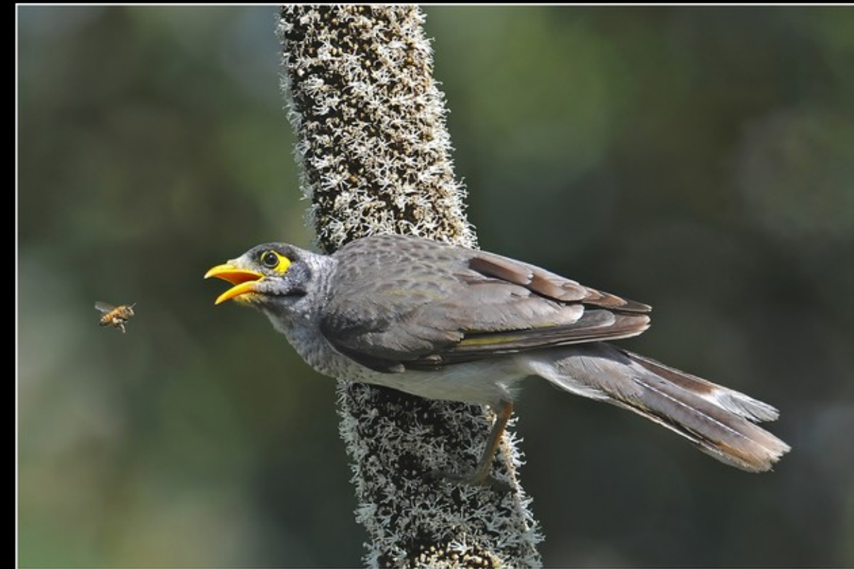
NB-M-Cor Rademeyer-37-G-Saad En By Ontbyt