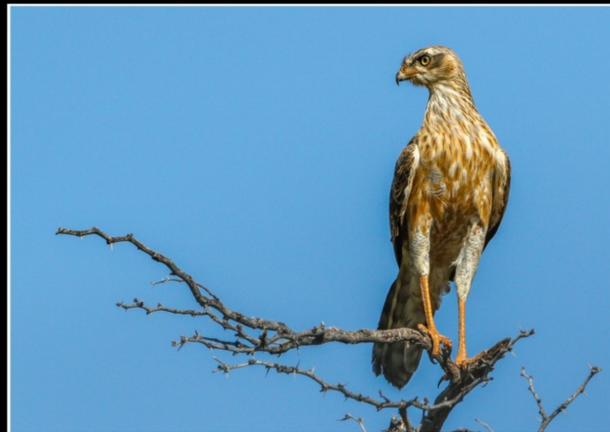
NB-3 star-Rodney Van Soest-38-G-Juvenile Pale Chanting Goshawk