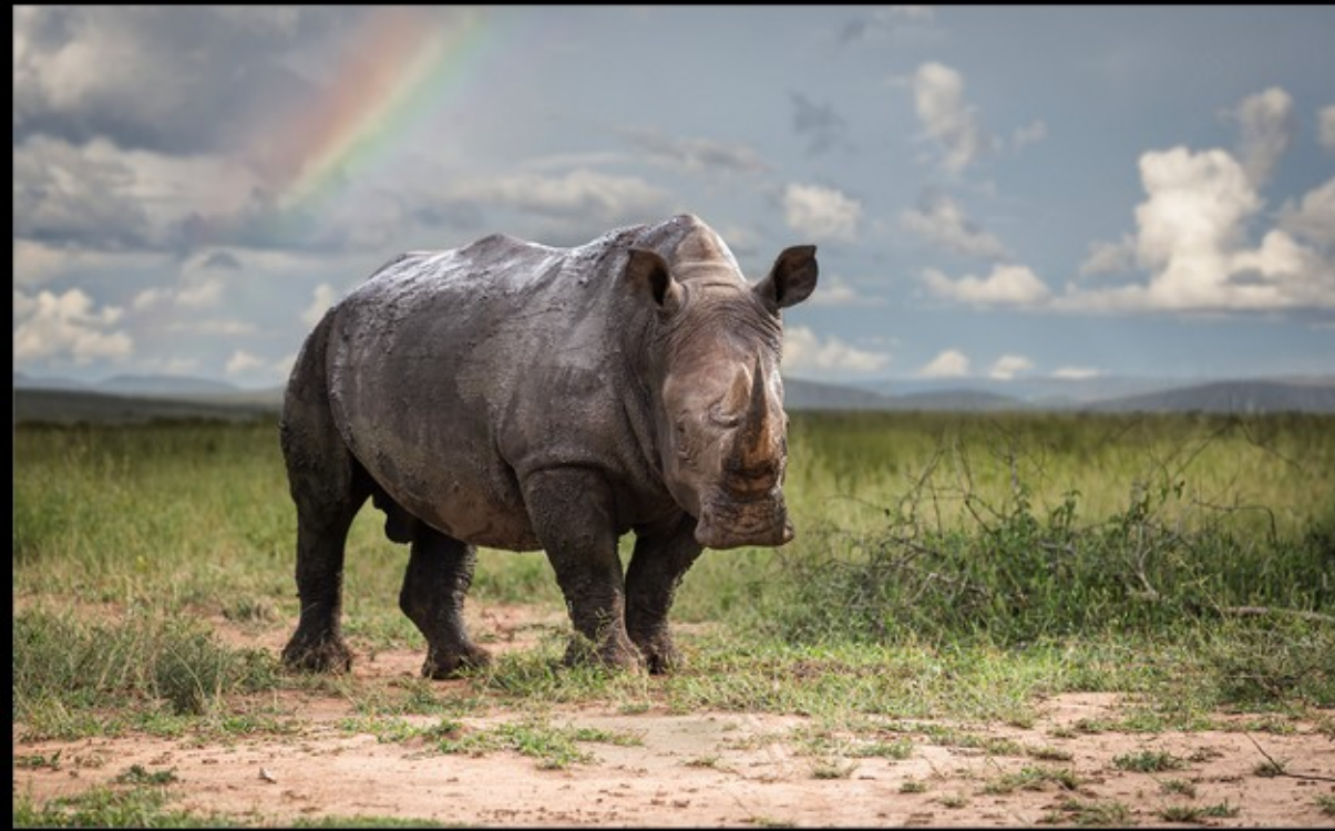
PO-5 star-Rina Hattingh-38-G-South African Giant