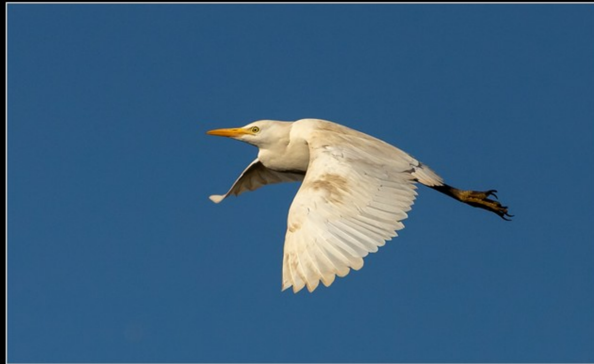
NB-M-Chrissie De Beer-35-G-In 'Mug