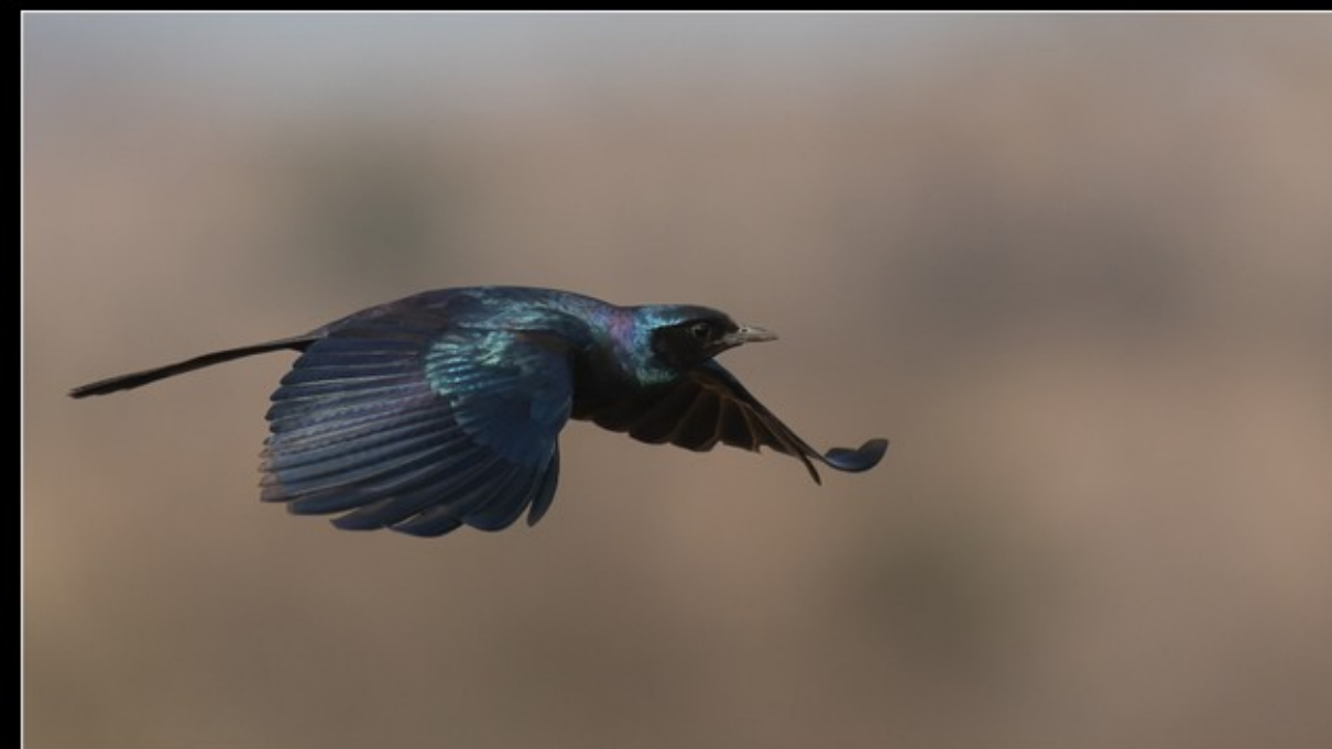
NB-5 star-Martha Koch-34-G-Grote Glansspreeu