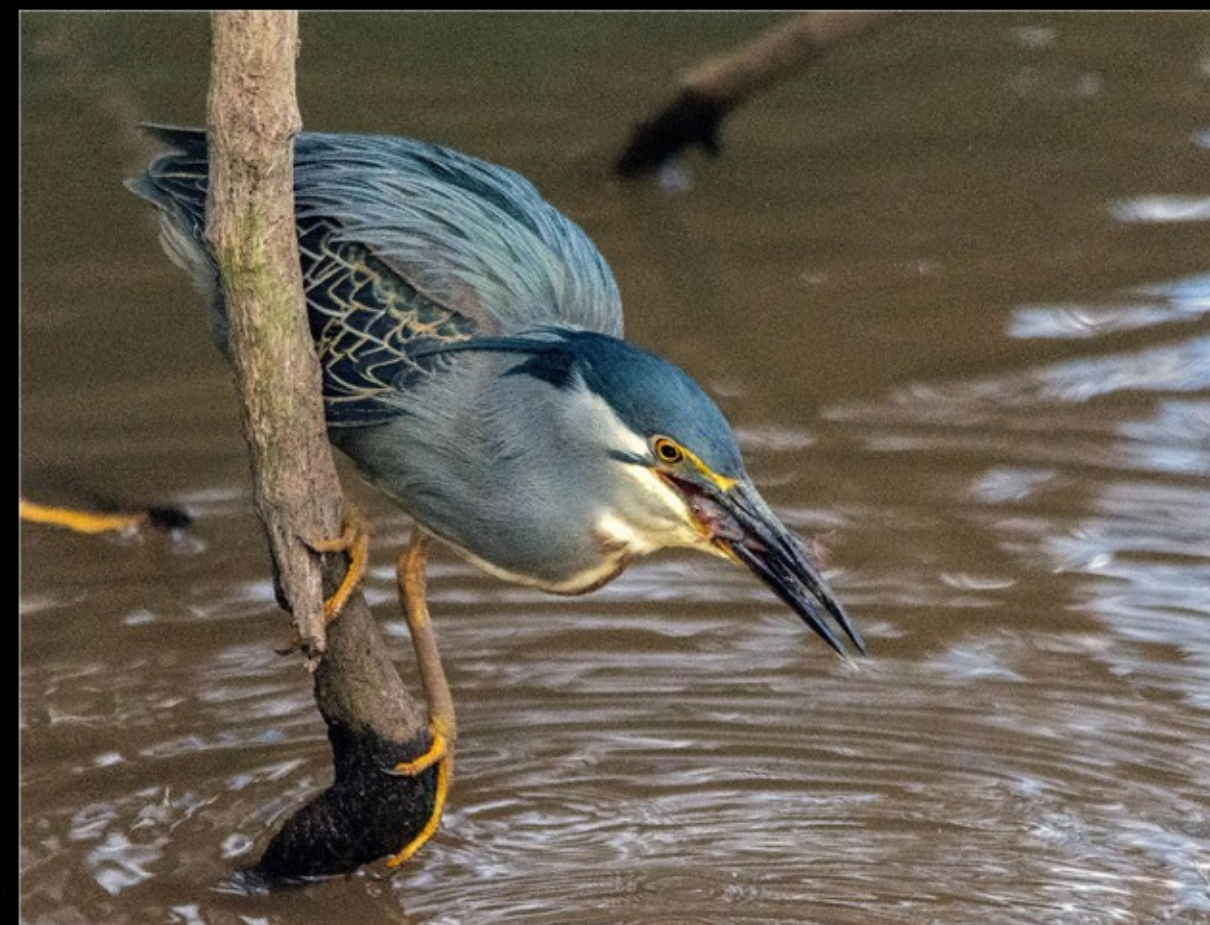
NB-4 star-Mechiel Brandt-28-S-Groenrug Met Vangs