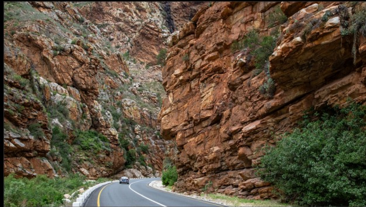
SC-M-Neels Jackson-34-G-Oral Kranse