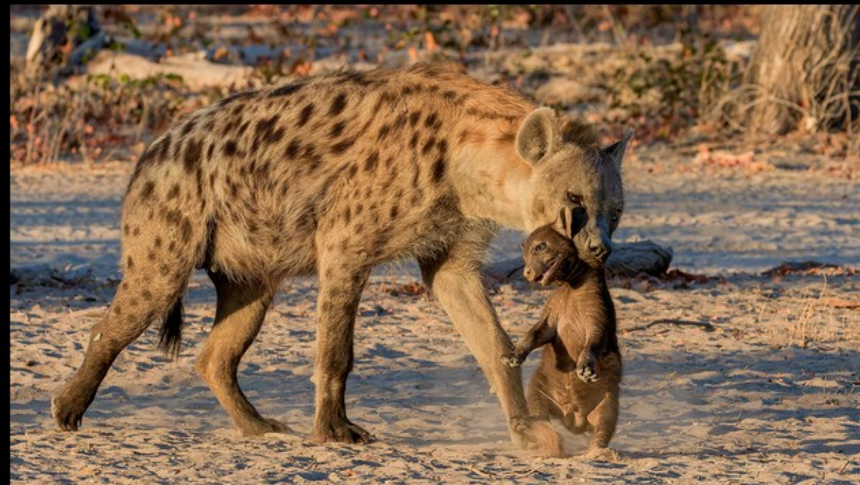
NAM-Sonelle Basson-37-G; Ctg Wfn-Moving Den