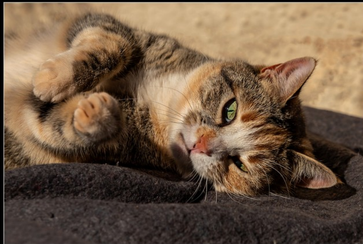
PO-M-Chrissie De Beer-34-G-Mia