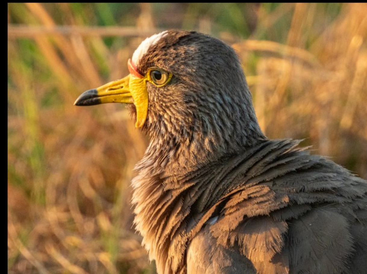
NB-3 star-Lydia Wolmarans-32-G-Lelkiewiet