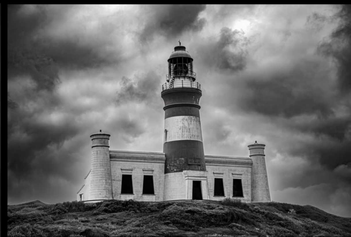
PO-5 star-Carima Van Den Berg-37-G-Agulhas Lighthouse