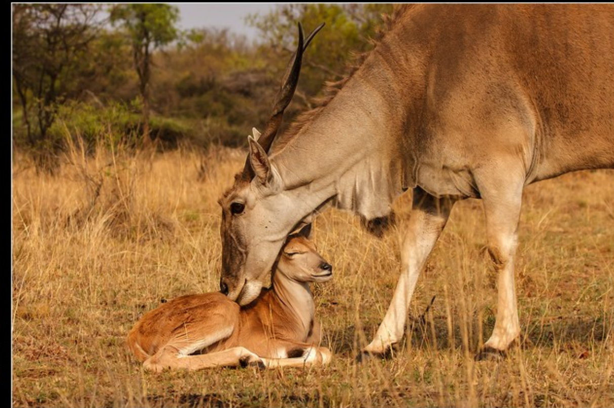
NAM-Henning De Beer-33-G-Moederliefde