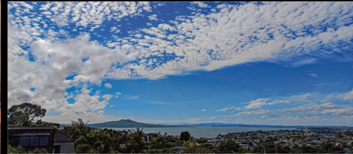
SC-M-Trippie Msser-32-S-Clouds Over The Ocean