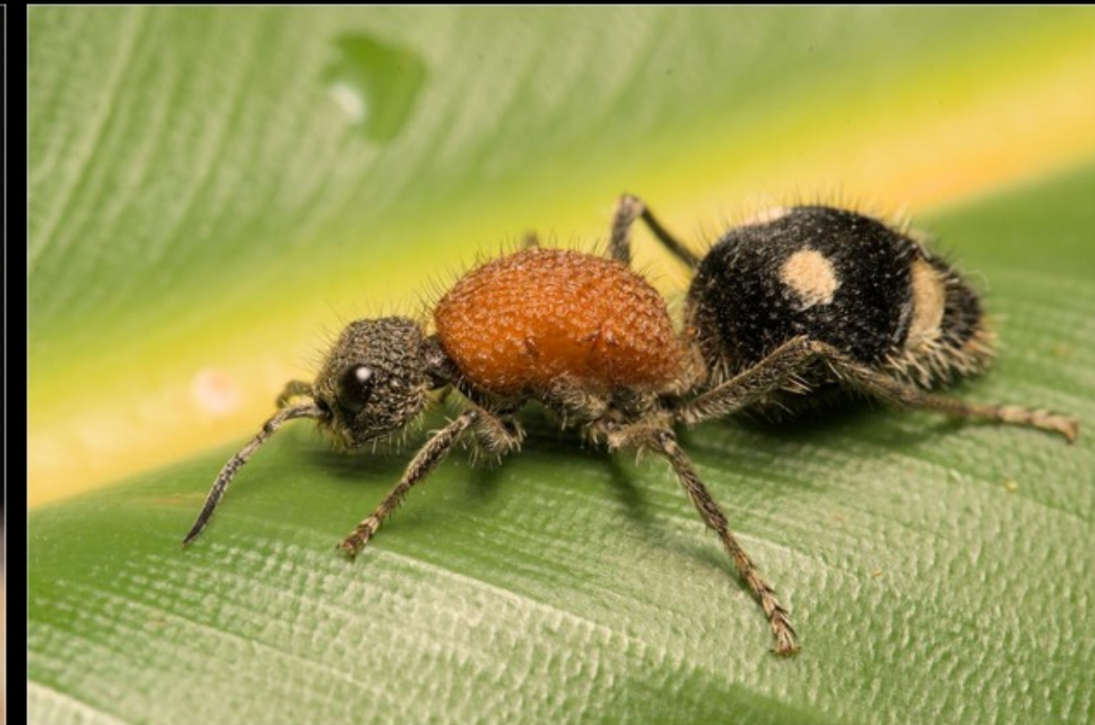
NA-5 star-Willem Semmelink-34-G-Merwespe Wyrfie