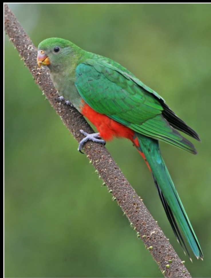
NB-M-Cor Rademeyer-32-S-King Parrot Female