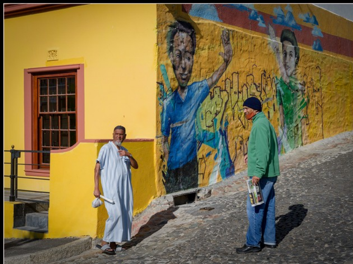
PJ-M-Ezabe Bogenhofer-35-G-Djy Loop Verkeerd And Be Blessed