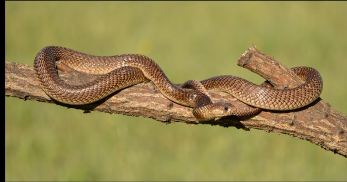
PO-M-Hannie Stephens-36-G-Mozambique Spitting Cobra