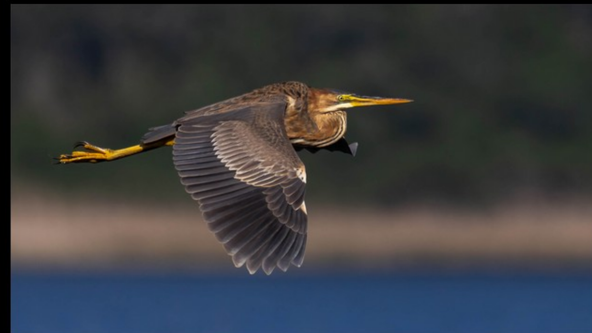
NB-M-Carien Kruger-35-G-Purple Heron