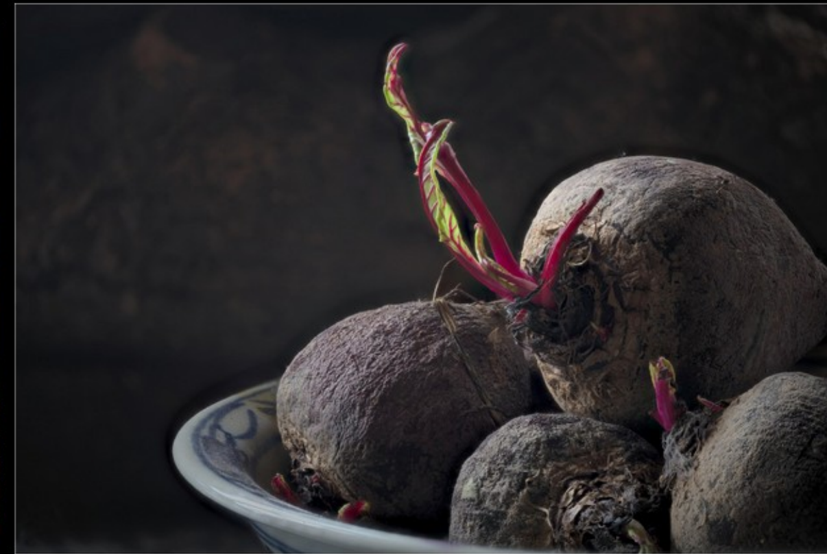
PO-5 star-Willem Semmelink-34-G-Beet Teen Die Lig