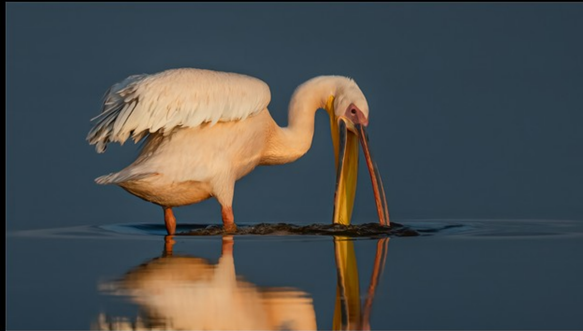
NB-M-Tania Cholwich-41-COM; WIN; Ctg Win-Pelican In Golden Light